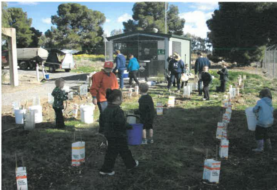
One of our tree planting days with Tally School